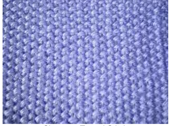
Close up: Tweed Stitch

Don't like the linen stitch? Flip it over, the back of this swatch (wrong side) is called Tweed Stitch. It looks like a very dense Moss stitch! Same pattern- two different results!