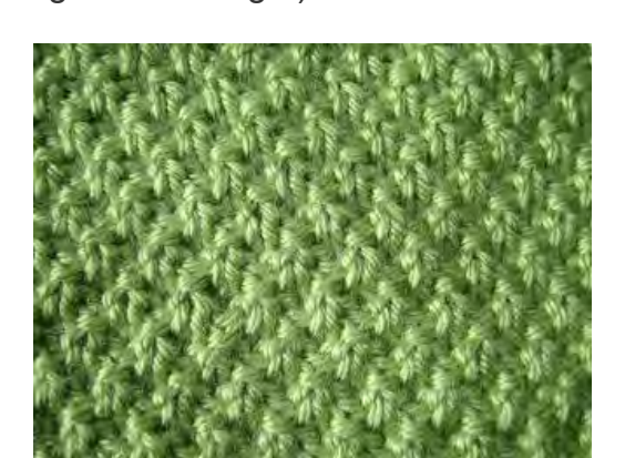
Close up: Double Moss Stitch

Bind off (loosely so your edge isn't too tight).