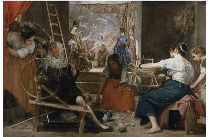
Las Hilanderas (The Spinners) by the Sevillian painter Diego Valázquez in 1648.

Arachne was a talented weaver in Greek mythology who dared to challenge Athena, the goddess of wisdom and crafts, to a weaving contest. Arachne created a tapestry that highlighted the flaws and weaknesses of the gods, which Athena was not thrilled about. Arachne also boasted that her skill was superior to Athena's. In her anger, Athena lashed out, destroyed Arachne's tapestry, and beat her.