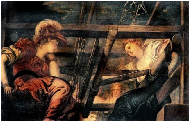
Minerva e Aracne by Jacobo Tintoretto is an oil painting (circa 1579) at the Uffizi Gallery in Florence, Italy.

Feeling repentant after, Athena transformed Arachne into a spider, condemning her and her descendants to weave forever. Myths often have themes and this myth explores themes of skill, pride, and divine retribution- it also serves as a cautionary tale about challenging the gods, or, as in this case, the goddesses!